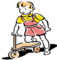
to ride a bike