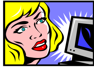
to work with computer