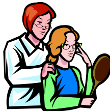
to put something in order

T: Guys, we have a text to read. But before to do it listen to me and look at the blackboard.