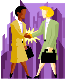
to meet friends

T: So, guys. Now you are ready to use these word combinations in our communication. You have cards with them and your task is to make sentences.