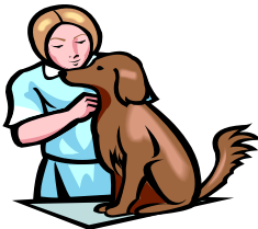
to play with dog