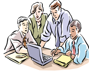
to learn something