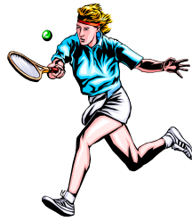
to play .